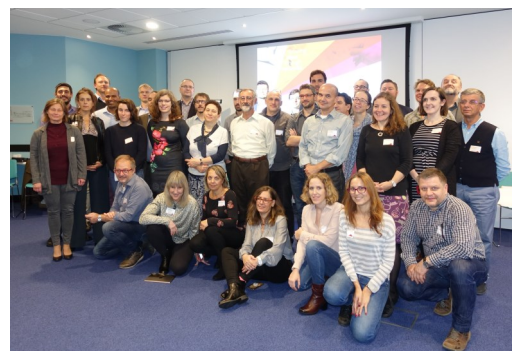
CA18219 Geothermal-DHC kick-off meeting, Brussels, October 2019